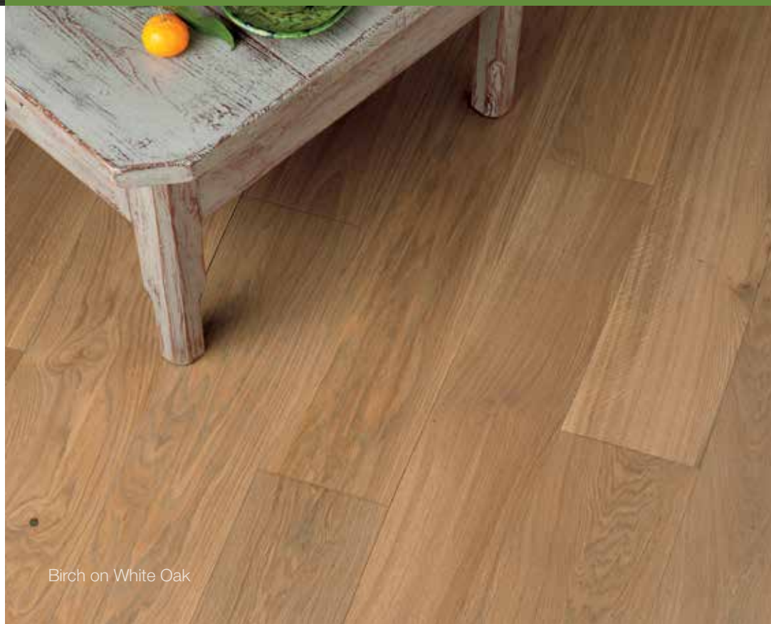
Birch on White Oak