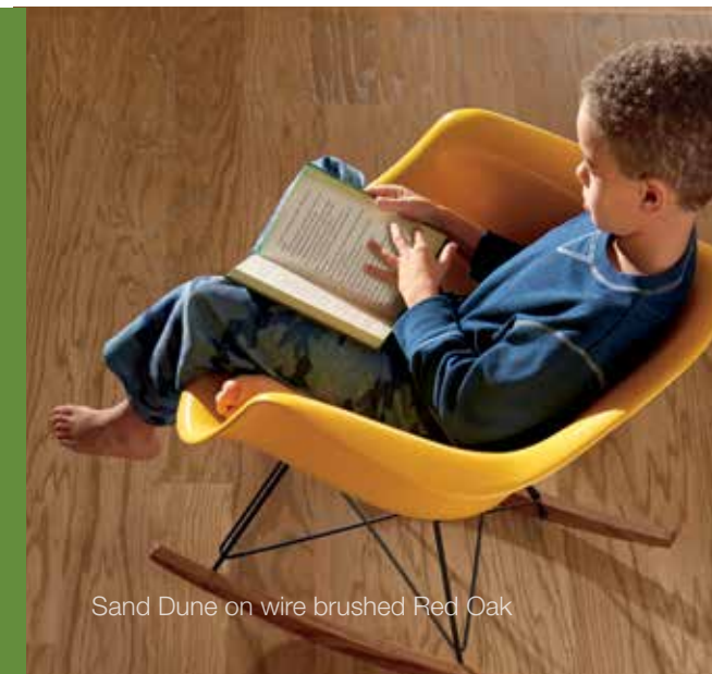
Sand Dune on wire brushed Red Oak

Depend on Bona. A passion for wood floors.