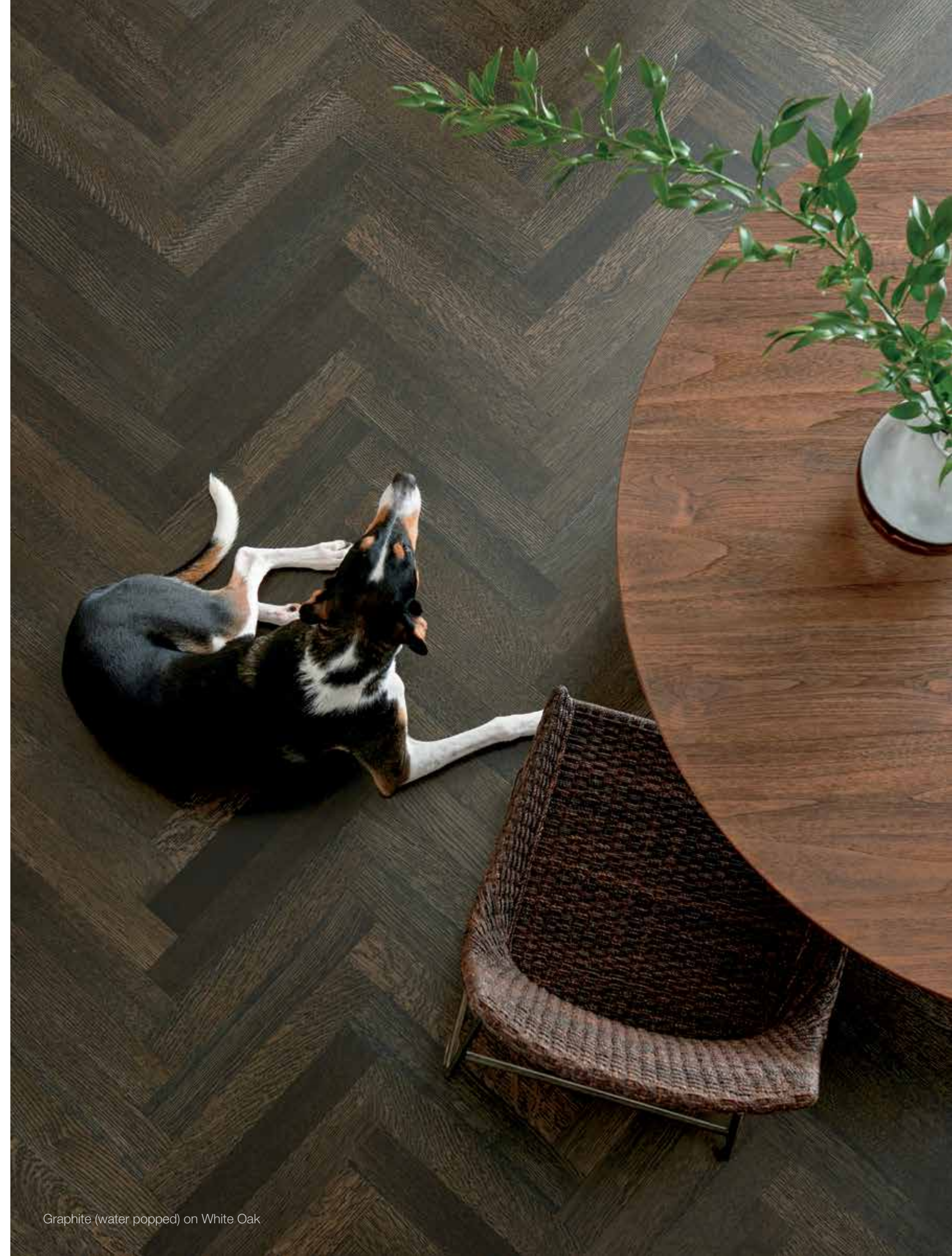
Graphite (water popped) on White Oak

Saturated reds and smoky browns. Grays and rich, chocolaty black. Each color captures an urban vibe that's just right for today's sophisticate. Even if he happens to have four legs.