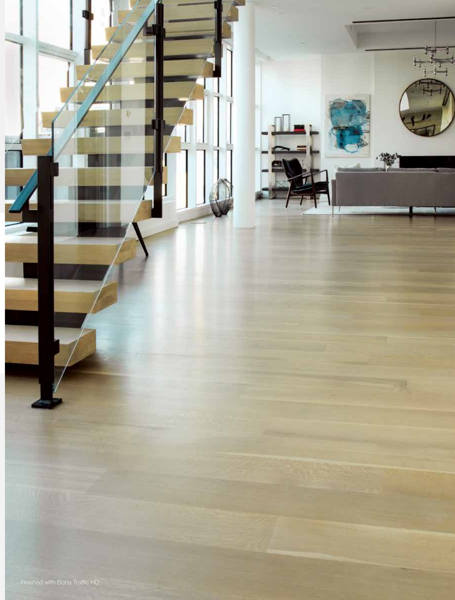
Finished with Bona Traffic HD