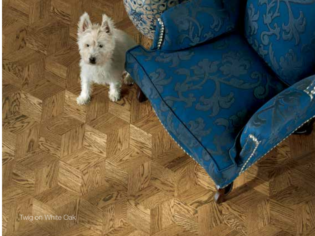
Twig on White Oak