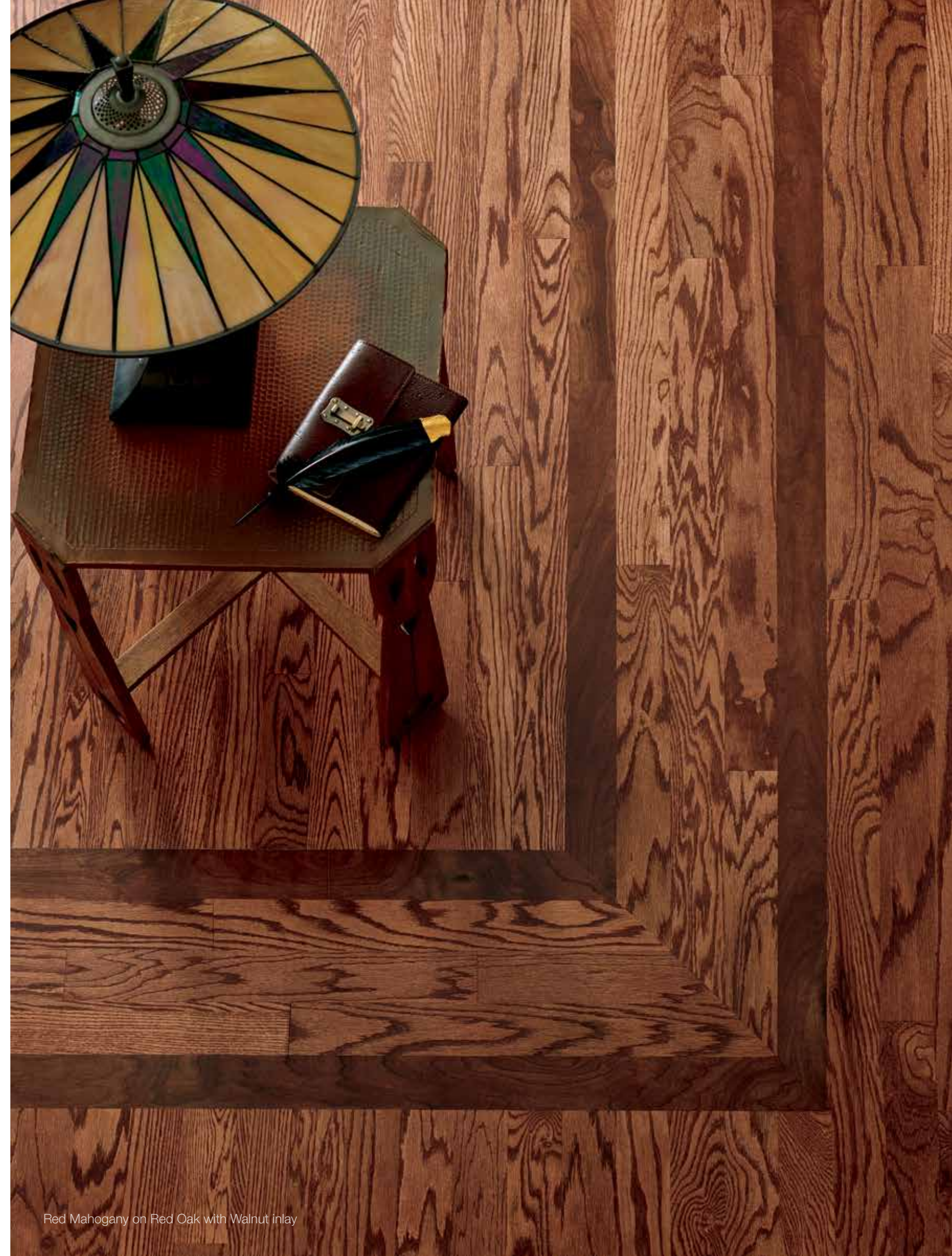
Red Mahogany on Red Oak with Walnut inlay

A rich presentation of authentic browns and rich auburns. This exemplary palette has its roots in the natural appeal of hardwoods. Dress it up or down to suit yourself.