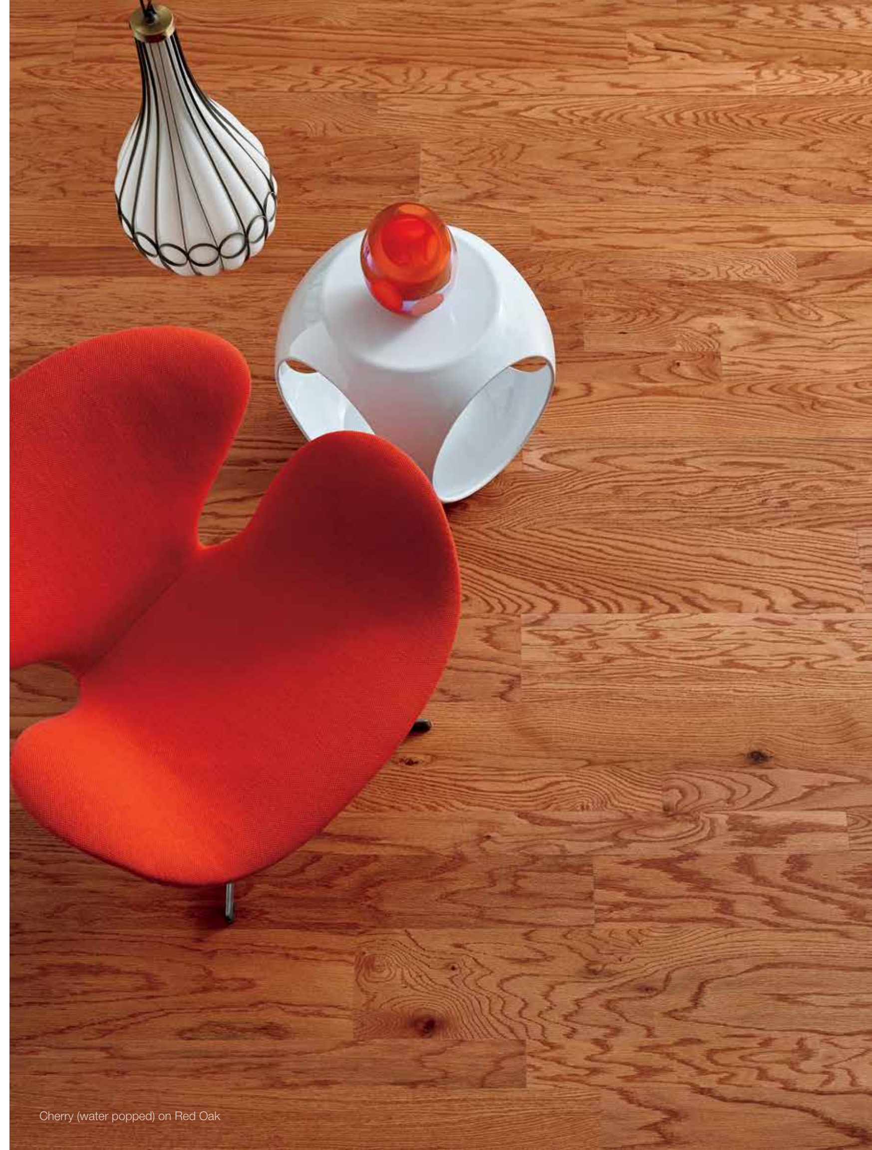
Cherry (water popped) on Red Oak

Warm ambers and hints of exotic spices transport this palette across varied design styles. Find just the right shade for your particular paradise.