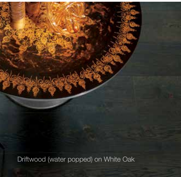
Driftwood (water popped) on White Oak

Metropolitan Urban, elegant, sophisticated